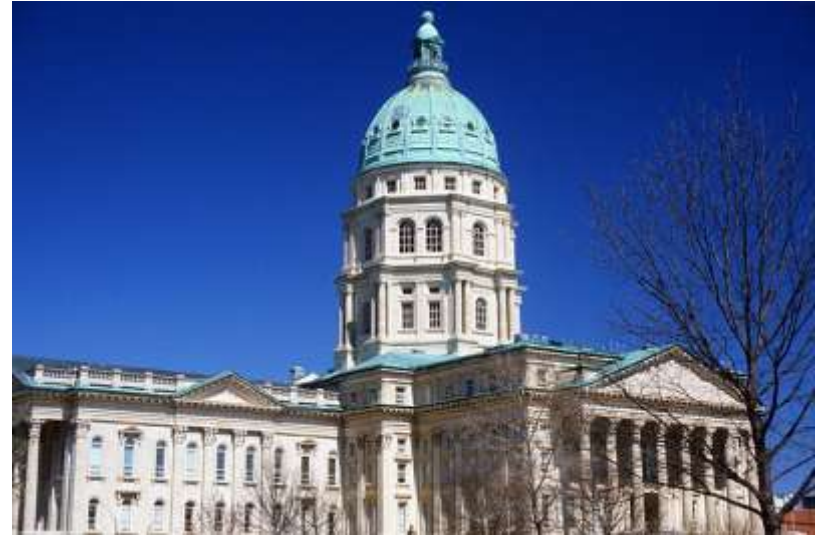
KANSAS STATE CAPITOL, TOPEKA