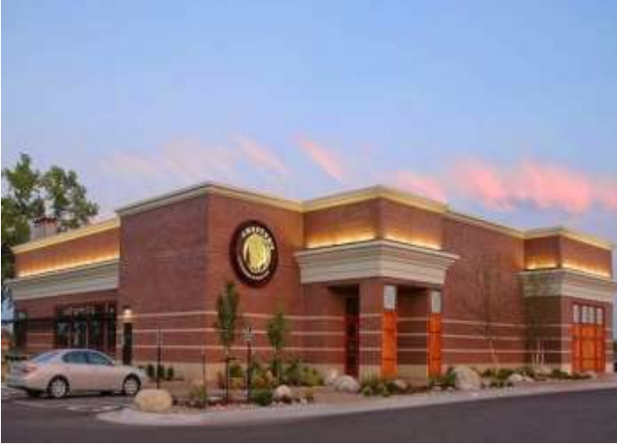
Chester's Chophouse and Wine Bar (31 – 50$)