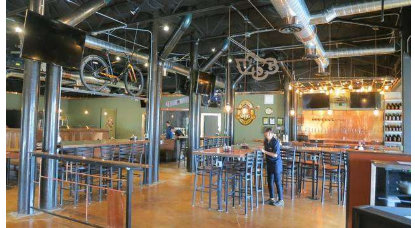
Wichita Brewing Co & Pizzeria (7 – 12$)