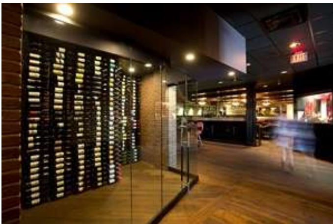
Scotch & Sirloin (36 $)