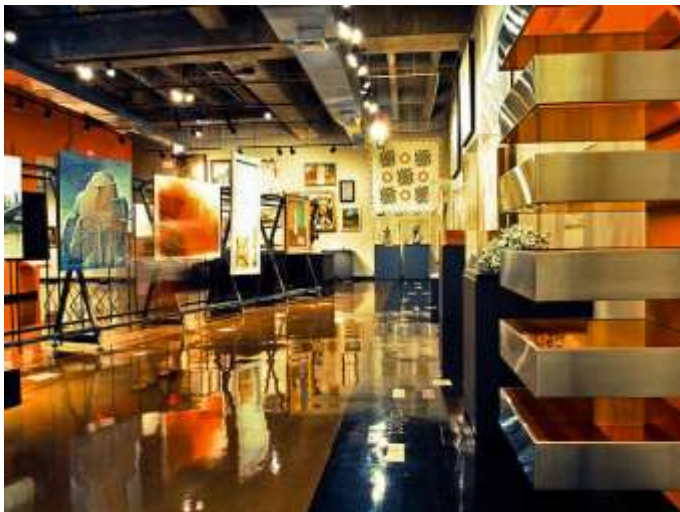
SPENCER MUSEUM OF ART, LAWRENCE