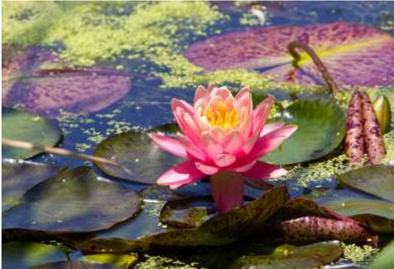
BOTANICA GARDEN, WICHITA