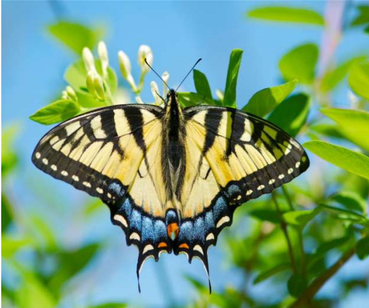
Eastern tiger swallowtail

Males are yellow with four black "tiger stripes" on each fore wing. The veins are marked with black. The postmedian area of the hind wing is black with yellow spots along the margin